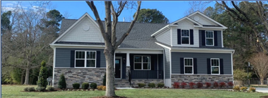
Award Winning Golf Course Community with Aquatics Center