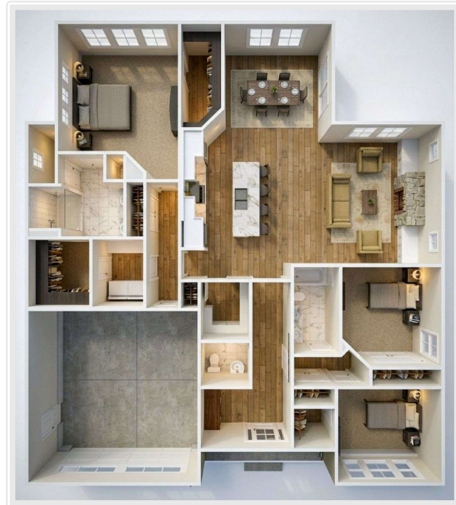
3D KESTREL RANCH STAGED 1 ST FLOOR